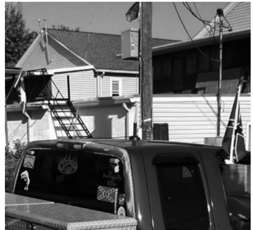
Detail of a street photograph in downtown Gettysburg, Pennsylvania.

A decision by the Seminary leadership to prohibit unfurled Confederate Battle flags during an encampment on the campus this summer at the end of June created a storm of opposition in social media circles, calls to boycott the Seminary Ridge Museum, charges of censorship, and more. The reactions earned the Seminary a link on one of the larger white supremacist websites as well. Voices from both South and North, both men and women, vigorously defended the need to allow them on the campus, even though contemporary supremacist groups had met in town during the previous encampment in 2014, creating potential confusion surrounding the flag's