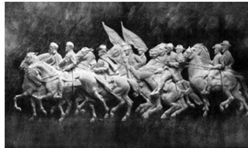
Gutzon Borglum's original bas-relief design for the Confederate memorial on Stone Mountain, Georgia.

But it was installation artist John Sims who created one of the strongest statements about this favorite symbolism of the Confederacy in a 2004 exhibit at Gettysburg College entitled "The Proper Way to Hang a Confederate Flag," part of a larger art show entitled Recoloration Proclamation: The Gettysburg Redress . The exhibit ridiculed the Confederate Battle flag by dressing it up, colorizing and accessorizing it and treating it as if it were a mere stylized garment or a decoration. The installation entitled "The Proper